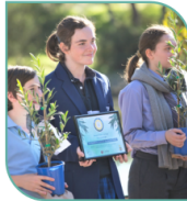
Student representatives are presented with a Catholic Earthcare Schools certificate and a tree at the Diocese of Sandhurst launch of their Laudato Si' Action Plan.

Catholic Earthcare schools and parishes demonstrate care for our common home through prayer, conversation and education. They create plans for ways they can put each of the Laudato Si' Goals into action.