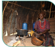
A woman prepares a pot of traditional tea in her home in southwestern Ethiopia.

The Response to the Cry of the Poor is a call to promote eco-justice, and being aware that we are called to protect human life from conception to death, and all forms of life on Earth.