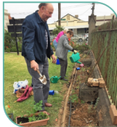
Ethnic parishioners planting a herb garden after Mass.

It asks us to consider how we use resources and energy in a way that avoids wastage or pollution.