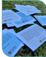
Quotes used as part of an activity in the Walking with God Program.

The program also ties together nature-based activities and Australian First Nations ways of caring for Country, showing how we can live and share faith together.